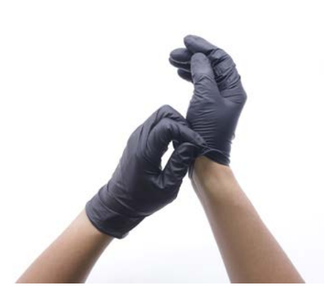
4. Slide your fingers under the wrist of the other glove

1. Grasp the outside of the glove in the wrist area