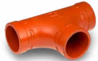
VSH Shurjoint Grooved fittings

VSH Shurjoint is a complete grooved piping system range including couplings, fittings and valves