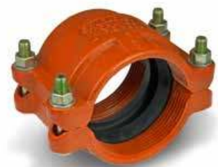
VSH Shurjoint Plain-End