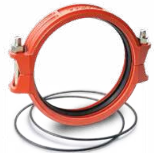
VSH Shurjoint Ring Joint