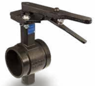
VSH Shurjoint Valves